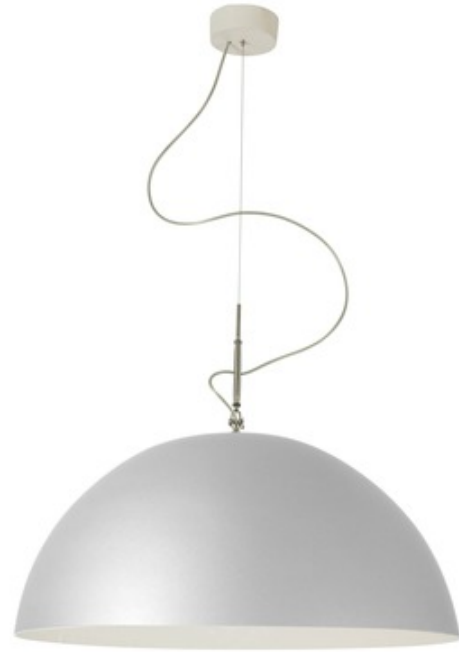
Shown in: Silver / White

Luna Mezza Luna Silver Pendant is inspired by the moon's mysteries. Constructed of Nebulite, a specially developed material made of resins and fibers, that mimics the uneven, softly luminescent qualities of the moon's surface. Features a Silver outer shade with a lining in White which casts a pleasant glow on any surface. Available in two sizes. Includes 4 feet of cable to customize length. Handmade in Rome, Italy. CE and ETL listed.