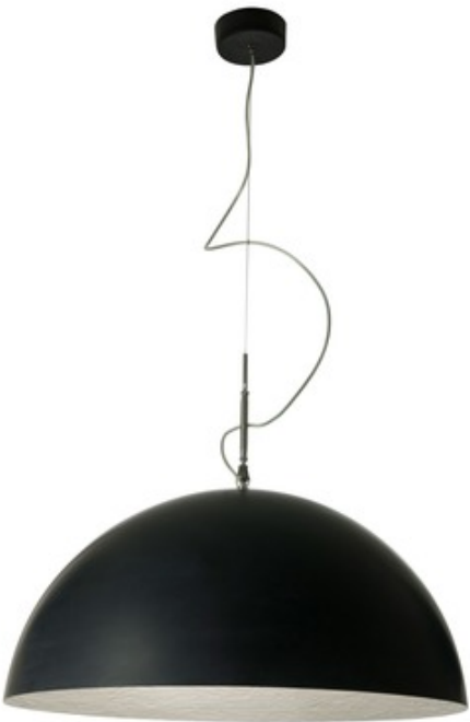
Shown in: Black / Silver

The Mezza Luna Pendant is inspired by the moon's mysteries. Constructed of Nebulite, a specially developed material made of resins and fibers, that mimics the uneven, softly luminescent qualities of the moon's surface. Handmade in Rome, Italy.