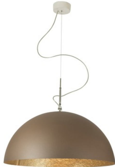
Shown in: Bronze / Gold

Luna Mezza Luna Bronze Pendant is inspired by the moon's mysteries. Constructed of Nebulite, a specially developed material made of resins and fibers, that mimics the uneven, softly luminescent qualities of the moon's surface. Features a Bronze outer shade with a lining in Gold or White which casts a pleasant glow on any surface. Available in two sizes. Includes 4 feet of cable to customize length. Handmade in Rome, Italy. CE and ETL listed.