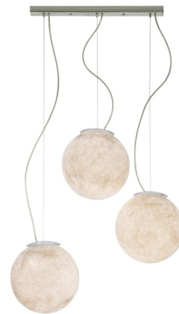
Shown in satin nickel / white

Luna Tre Lune Pendant is inspired by the moon's mysteries. The globe shaped shades are constructed of Nebulite, a specially developed material made of resins and fibers, that mimics the uneven, softly luminescent qualities of the moon's surface. Available in White with a Satin Nickel finish. Includes 4 feet cables to customize length. Handmade in Rome, Italy.