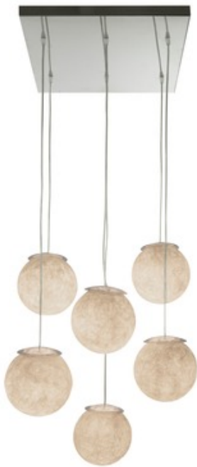
Shown in: Satin Nickel / White

Luna Sei Lune Pendant is inspired by the moon's mysteries. The globe shaped shades are constructed of Nebulite, a specially developed material made of resins and fibers, that mimics the uneven, softly luminescent qualities of the moon's surface. Available in White with a Satin Nickel finish. Includes 4 feet cables to customize length. Handmade in Rome, Italy.