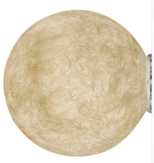
Shown in: White

Luna A.Moon Wall Sconce is inspired by the moon's mysteries. Constructed of Nebulite, a specially developed material made of resins and fibers, that mimics the uneven, softly luminescent qualities of the moon's surface. The globe shaped shade is constructed of Nebulite, a specially developed material made of resins and fibers, that mimics the uneven, softly luminescent qualities of the moon's surface. Available with a White Shade which casts a please glow on any surface, in three sizes.