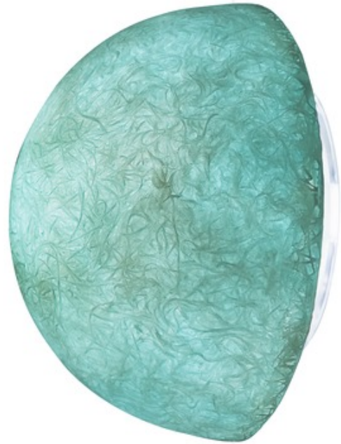
Shown in: Turquoise

Luna Button Wall Sconce is inspired by the moon's mysteries. Constructed of Nebulite, a specially developed material made of resins and fibers, that mimics the uneven, softly luminescent qualities of the moon's surface. Available with a White, Red, Orange, Turquoise, Magenta, or Blue with a White shade.