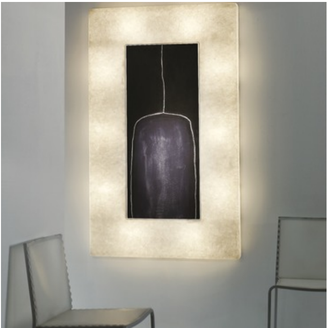
Shown in: White / White

Luna Lunar Bottle Wall Light is inspired by the moon's mysteries. Constructed of Nebulite, a specially developed material made of resins and fibers, that mimics the uneven, softly luminescent qualities of the moon's surface. Available in White border that is lit with a Black center with a bottle drawing.