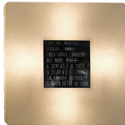
Shown in white / white

Luna Fragments Wall Sconce is inspired by the moon's mysteries. Constructed of Nebulite, a specially developed material made of resins and fibers, that mimics the uneven, softly luminescent qualities of the moon's surface. Available in White with a Black center.