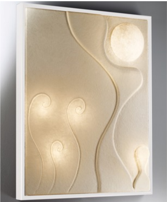
Shown in: White / White

Luna Lunar Dance 3 Wall Sconce is inspired by the moon's mysteries. Constructed of Nebulite, a specially developed material made of resins and fibers, that mimics the uneven, softly luminescent qualities of the moon's surface. Available in a White shade embossed with a unique design, and finished in White or Black.