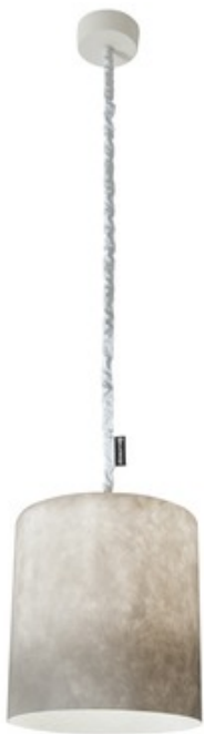
Shown in: White / White

Matt Bin Nebula Pendant is inspired by the moon's mysteries. Constructed of Nebulite, a specially developed material made of resins and fibers, that mimics the uneven, softly luminescent qualities of the moon's surface. Available in White with a White finish. Includes 4.5 feet of cord to customize length. Made in Rome, Italy. ETL and CE listed.