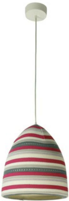
Shown in: White / Red

Trame Flower Stripe Pendant presents a structure in Nebulite covered by a removable striped 100 percent wool yarn, created by specialized sartorial laboratories. The chromatic effect, mixed with the light, creates a multitude of colors. Available with stripes of in Blue, Purple, Red, and Yellow shade with a White finish. Includes 4 feet of cable to customize length. Handmade in Rome, Italy.