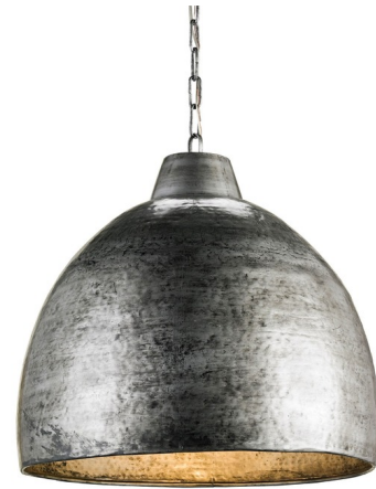
Shown in blackened steel

The Earthshine Pendant offers a simple, yet versatile look that will tie seamlessly into a number of interiors, featuring a dome shade slightly hammered finished in Blackened Steel or Vintage Brass. UL and cUL listed.