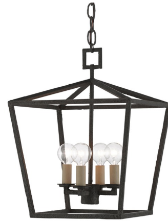
Shown in mole black

The Denison Lantern pendant offers a chic and airy look inspired by a hanging lantern, featuring hammered wrought iron. A design element of note is the square that fastens the lantern to the chain.