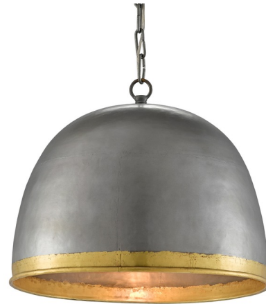
Shown in pewter