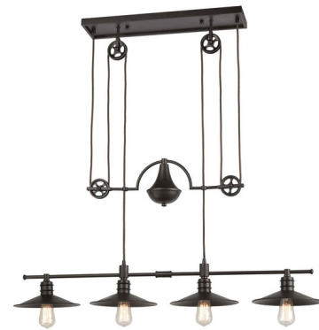
Shown in oil rubbed bronze

The Spindle Wheel Linear Island Pendant is an adjustable pulldown fixture that has large pulleys inspired by early 1900's design, cast canopy, counterweight and socket holders for added vintage style. This style would work well in an industrial or farmhouse setting. Finished in Oil Rubbed Bronze. Min/Max Overall Height: 39 inch/72 inch. UL listed.