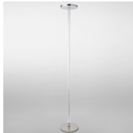
Shown in chrome / clear

The In Between Floor Lamp is a sleek piece that virtually melts into your decor with a pair of chrome-plated discs joined by a transparent glass tube. The thin power cord visible within the lamp's stem is a subtle nod to Wilhelm Wagenfeld's 1924 Bauhaus table lamp design. LED light sources within the upper disc cast light upwards for an indirect lighting effect. Dimmer switch located on cord.