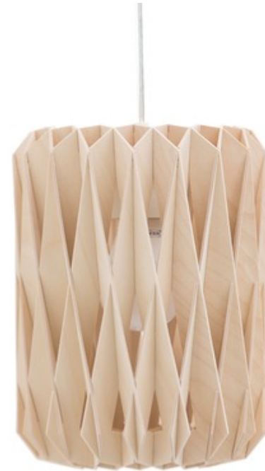
Shown in: White / Natural

The Pilke Pendant was created by the industrial designer Tuukka Halonen. Pilke is a Finnish word that means twinkle. Pilke shades are constructed of identical interlocking parts and the repetition of plywood parts which creates a beautiful three dimensional, geometrically decorative light shade. Pilke is entirely made in Finland of birch plywood and assembled by local craftsmen. Available with a White stain, Black stain, or Natural birch diffuser.