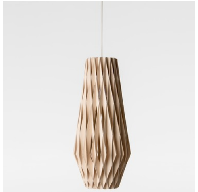
Shown in: White / Natural

The Pilke Tall Pendant was created by the industrial designer Tuukka Halonen. Pilke is a Finnish word that means twinkle. Pilke shades are constructed of identical interlocking parts and the repetition of plywood parts which creates a beautiful three dimensional, geometrically decorative light shade. Pilke is entirely made in Finland of birch plywood and assembled by local craftsmen. Available with a White stain, Black stain, or Natural birch diffuser.