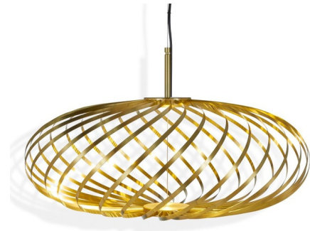
Shown in brass