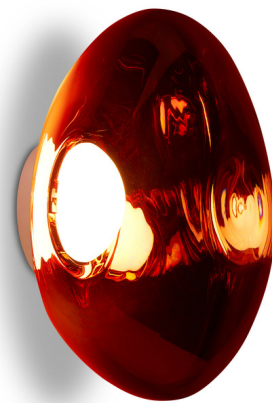
Shown in copper / copper

COLOR RENDERING . . . . . 90 CRI LAMP COLOR . . . . . 3000K LUMENS/WATT . . . . . 88.89 LUMINOUS FLUX . . . . . 800 lumens