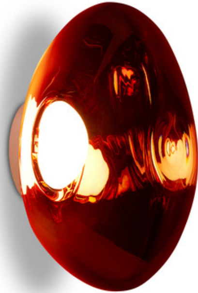
Shown in: Copper / Copper

The Melt Wall / Ceiling Light, designed by Tom Dixon, features a beautifully distorted globe that creates a mesmerizing melting hot blown glass effect. The Copper, Gold, Silver, and Smoke shades are translucent when on and mirror-finish when off to emit an attractive display of light. The Opal shade offers a more traditional look and produces a gentle, warm glow. Includes 98 inches of cord to use as a floor lamp. May be mounted as wall or ceiling light. Not intended for outdoor use. UL and cUL listed. Designed in London.