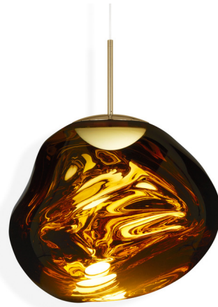
Shown in gold / gold

LAMP COLOR . . . . . 3000K LUMENS/WATT . . . . . 133.33 LUMINOUS FLUX . . . . . 800 lumens