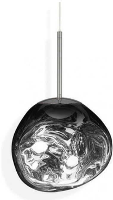
Shown in: Chrome

The Melt Pendant is obsessed with the idea of creating an imperfect, organic and naturalistic lighting object. Created in collaboration with FRONT, a Swedish design collective, Melt is evocative of molten glass, the interior of a melting glacier, or images of deep space. Available in two sizes finished in Chrome, Gold, Smoke, or Copper. Lamping option of Incandescent or LED. When turned on, the pendant becomes a translucent textured color. Canopy: 4.9 inch diameter. UL and CUL listed.