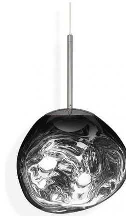
Shown in silver / silver