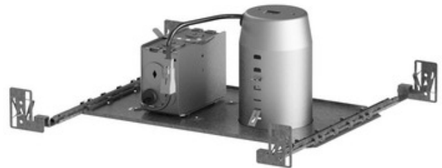
Shown in: Galvanized Steel

The Urbai 3.5 Inch 120 Volt Performance 2 New Construction Non-IC Airtight Housing is a 15 watt housing with up to 1326 lumens (650 lumens for Warm Dim). Non-IC designation requires a 3 inch minimum clearance away from housing. Cutout diameter: 3 5/8 inch. Can fit ceilings up to 2 inches thick. Universal housing (120V 15W ELV/0-10V). Dimmable with a low voltage electronic or 0-10V dimmer (see attached manufacturer reference for dimmer compatibility). A complete fixture includes a housing and trim, sold separately.