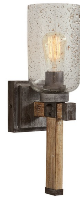
Shown in mango wood / stone seeded

The Nolan Wall Sconce showcases the character and warmth of Mango Wood and Stone Seeded glass. Handcrafted making each piece unique. UL listed. Suitable for damp locations.