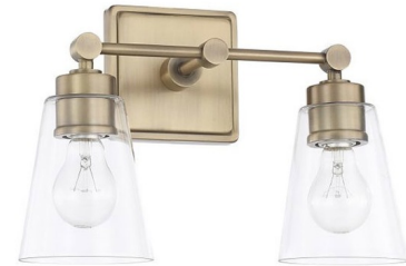
Shown in aged brass / clear

The Rory Bathroom Vanity Light features a striking contrast between bold, straight-lined metal components and clear, conical glass shades. Available in multiple finishes and sizes, this fixture is suitable for a wide range of interior design styles from urban industrial to transitional. It can be installed facing up or down.