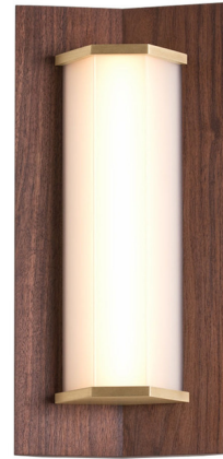
Shown in walnut / brushed brass

The Penna Wall Sconce offers an elegant design that balances utility and sophisticated beauty, featuring a slightly curving Walnut wood rectangular backplate accented with Brass pieces and complete with a half hexagonal Frosted polymer diffuser. Available in three sizes with 2700K and 3500K color temperature options. Dimmable with compatible TRIAC, ELV, or 0-10V dimmers.