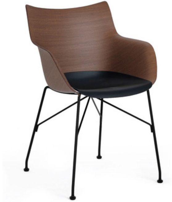
Shown in: Black / Dark Wood Veneer / Black

The Q/Wood Armchair is a simple piece that will work in a variety of settings. The curved, molded seat with sides rests atop a steel frame making this both decorative and comfortable. Available in light or dark slatted Ash or basic veneer with a White or Black seat and Chrome or Black finish legs.