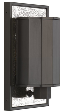
Shown in antique bronze / mercury glass

The Latigo Bay Wall Sconce has a timeless style that would be a beautiful addition to a variety of decors. Ideal for any space where accent lighting is needed, kitchen, bath, bedroom, living room, home office, laundry room, stairway, hallway or entryway. Features an Antique Bronze finished curved metal shade that sits on the back-plate lined with Mercury glass. The curved metal shade funnels light top and bottom, casting beautiful effects on the wall above and below. ADA compliant. cETL listed.