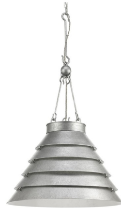
Shown in galvanized steel

The Surfrider Pendant design is like gentle waves lapping on a sandy shore. The tiers of metal curves flow together into a circle and is styled to light with a soothing glow. The clean, crisp and simple look will lend this pendant to coastal, urban industrial, modern or farmhouse decors. Choose from Galvanized steel or Maliblu finish.