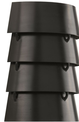
Shown in antique bronze

The Surfrider Wall Sconce design is like gentle waves lapping on a sandy shore. The tiers of metal curves flow together into a half circle and is styled to light the wall below with a soothing glow. The clean, crisp and simple look will lend this sconce to coastal, urban industrial, modern or farmhouse decors. cETLus listed.