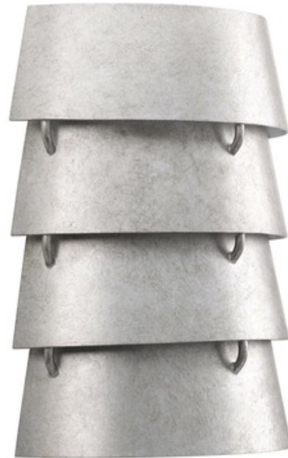
Shown in: Galvanized Steel

The Surfrider Wall Sconce design is like gentle waves lapping on a sandy shore. The tiers of metal curves flow together into a half circle and is styled to light the wall below with a soothing glow. The clean, crisp and simple look will lend this sconce to coastal, urban industrial, modern or farmhouse decors. Choose from Galvanized, White or Antique Bronze finish. cETLus listed.