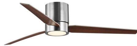
Shown in brushed nickel / silver / american walnut

LAMP LIFE . . . . . 50000 hours COLOR RENDERING . . . . . 90 CRI LAMP COLOR . . . . . 3000K LUMENS/WATT . . . . . 77.78 LUMINOUS FLUX . . . . . 1400 lumens