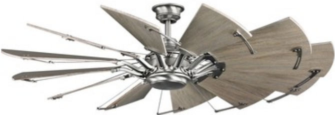
Shown in: Antique Nickel / White Barnwood

The Springer Ceiling Fan has a rustic flair with an impressive 12 fan blades and 60 inch span making it a statement-making fixture perfect for any room with a Farmhouse, industrial or transitional style. A powerful and quiet DC motor and with a 22 degree blade pitch this fan is the perfect fan to use to cool any room. Includes a full function six-speed remote, 8 inch downrod, and is complete with a dual mount canopy that accommodates flat or sloped ceilings up to 22 degrees. Available with an Antique Nickel motor with White Barnwood blades or an Architectural Bronze motor with Distress Walnut blades. UL listed, title 20 compliant. NOTE: Light kits can not be used with this fan.