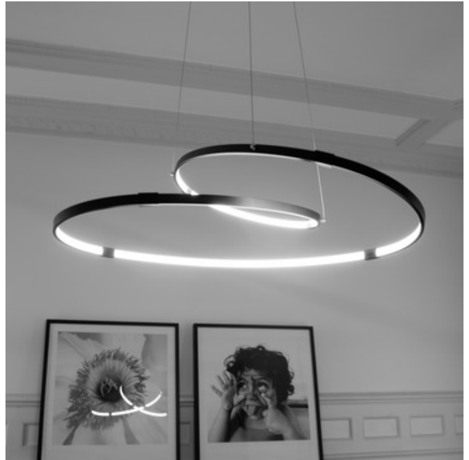
Shown in: Black / White

The Zigouzi Pendant will please the most discerning eye. The modern and stylish design is a three dimensional pendant in Black anodized aluminum with warm white high powered LED lighting. The thin suspension wires and translucent power cord add to the impression that the pendant is floating in thin air. This pendant is suitable for a wide variety of surroundings. Available in two sizes. Dimmable with an LED compatible dimmer. CE certified. Made in France.