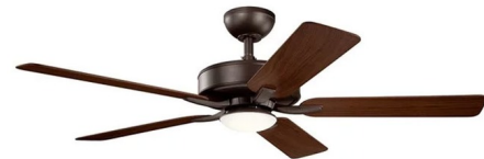
Shown in satin natural bronze / walnut

The Basics Pro Designer Ceiling Fan with Light complements a variety of decor and lighting styles. Available in Matte White with Matte White blades, Satin Black with Satin Black blades, White with White blades, or Satin Natural Bronze with Walnut blades. Features a 153mm x 15mm AC motor, five non-reversible ABS blades with a 52 inch blade sweep, and a 12 degree blade pitch. Includes a dimmable 17 watt LED light module with a frosted white polycarbonate diffuser, a 4 inch downrod, and a 337001 basic handheld control system. UL listed. Suitable for damp locations. Limited lifetime warranty. Optional downrod lengths and Cooltouch full function wall transmitter sold separately.