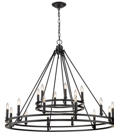
Shown in matte black

PRODUCT DIMENSIONS . . . . . Chain Length: 72"