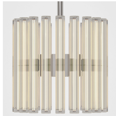
Shown in polished stainless steel / clear

The Aurora Chandelier projects an ethereal ring of light. Created and produced by Lee Broom, the hand blown glass bulbs contain a perpendicular LED filament which refracts against the vertical lines of the reed glass. This piece offers a sophisticated design that will enhance your surroundings. Available in three sizes. Overall drop length to be specified at time of order. Note: The GU18 linear LED bulb for this fixture is proprietary and replacements must be ordered from the manufacturer. Dimmable 20% - 100% with selected dimmers. Main voltage Trailing Edge. Contact manufacturer for recommended dimmers. Note: Due to the weight of the fixture, the 42.8 inch diameter chandelier requires additional ceiling support.