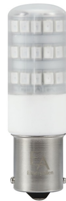
Shown in amber