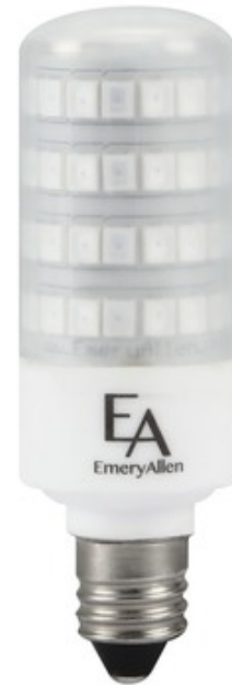
Shown in: Amber

The T4 Minican E11 Base 3 Watt Turtle 120 Volt LED lamp is approved for use in areas requiring artificial lighting adjacent to ecologically sensitive areas, sea turtle nesting beaches, migratory corridors, and Dark Sky Friendly communities. Turtle bulb LEDs have an amber color for safer illumination. Must be installed in a shielded or downward directed location to shield the light source from being directly or indirectly visible from the nesting beach. Not dimmable. ETL listed for damp locations. Suitable for enclosed fixtures. Sold as a 2-pack.