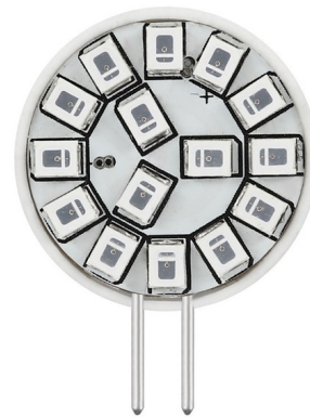
Shown in amber