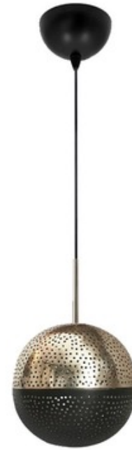
Shown in: Black / Polished Brass

The Kora Pendant offers a timeless form that combines Moroccan craftsmanship with modern aesthetics, featuring a perforated globe shaped shade composed of two half spheres with a Polished Brass, Copper, Gunmetal, or Antique Brass finished top and Black finished bottom.