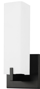
Shown in black / white opal

LAMP LIFE . . . . . 50000 hours COLOR RENDERING . . . . . 90 CRI LAMP COLOR . . . . . 3000K LUMENS/WATT . . . . . 62.40 LUMINOUS FLUX . . . . . 624 lumens