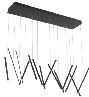
Shown in black / opal