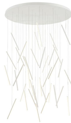
Shown in white / opal