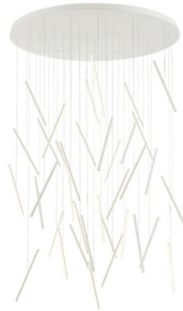
Shown in: White / Opal

The Chute Multi Light Chandelier is an interesting combination of art and light. Features Opal silicon diffusers that light the entire length of the extruded slim round aluminum cylinders. Choose from finely textured powder coat finish of Black or White. Individual height adjustment of the elements allows for user customization and an abundance of potential compositions. Includes 120 inch adjustable cables. Canopy: 50 inch diameter x 1.75 inch height. Note: Requires a special rated junction box for fixtures weighing over 50 pounds.