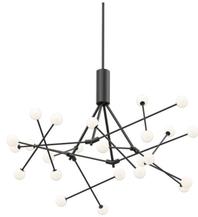
Shown in black / opal

The Moto Chandelier is a chaotic constellation of radiant globes that seemingly levitate about the center of the geometric structure. Fine intersecting Black metal arms project the Opal glass globes from the gravitational center and allow for positional adjustment during assembly. Includes one 4 inch, one 6 inch and three 12 inch downrods. Available in two sizes. ETL listed.