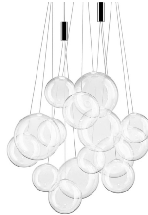
Shown in white / crystal

The Random Round Multi Light Pendant, designed by Cha-Yang Lee, is a magical piece consisting of groups of three spherical blown glass diffusers in Crystal, Chrome, Rose Gold, or Gold. Each glass diffuser is a different size suspended from a thin cable attached to a White round canopy. Available with 3, 5, 7, 14, 24, or 36 three-light clusters. Damp location rated. ETL listed. CE listed.