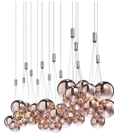
Shown in white / rose gold

PRODUCT DIMENSIONS . . . . . Cable length: 137.8" COLOR RENDERING . . . . . 90 CRI LAMP COLOR . . . . . 2700K LUMENS/WATT . . . . . 6,300.00 LUMINOUS FLUX . . . . . 6300 lumens