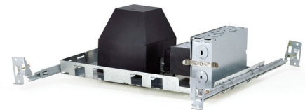
Shown in galvanized steel

APERTURE SIZE . . . . . 4.000" APERTURE SHAPE . . . . . Square HOUSING HEIGHT . . . . . 5" HOUSING TYPE . . . . . New construction NON IC Airtight CEILING TYPE . . . . . Drywall with Trim