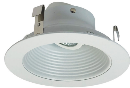
Shown in white reflector / white flange